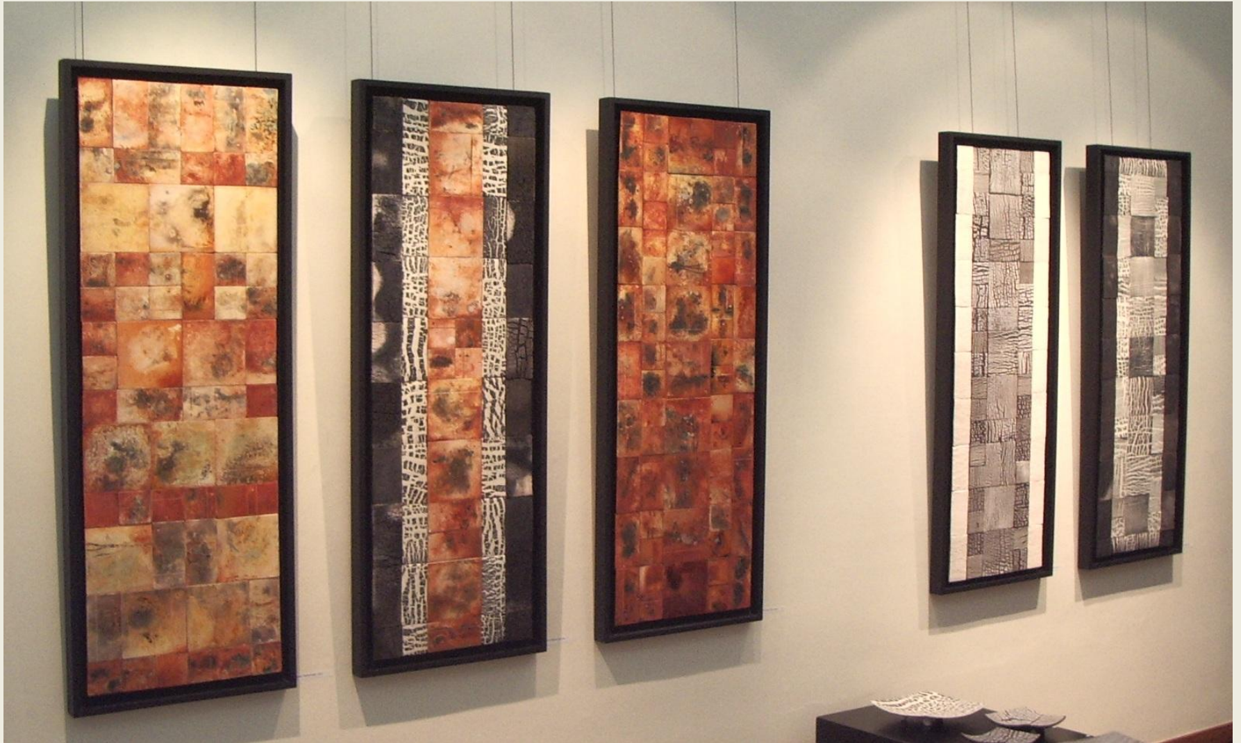
2006 "Cracked and Broken" – 5 murals (50 x 140 cm)